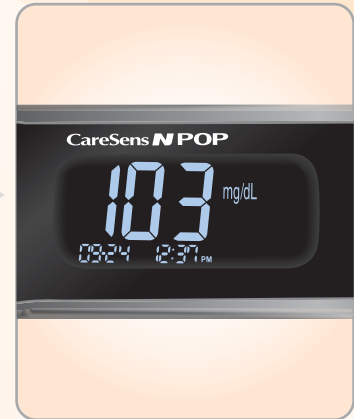
3 Result in 5 seconds