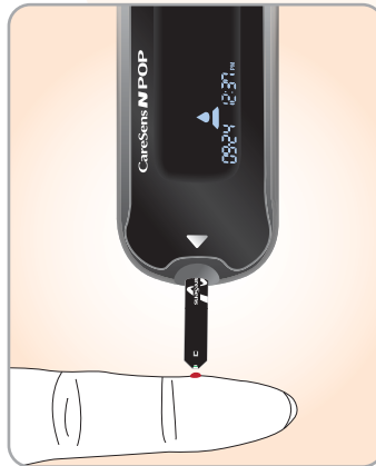
2 Apply blood sample