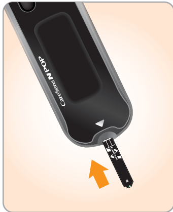
1 Insert test strip